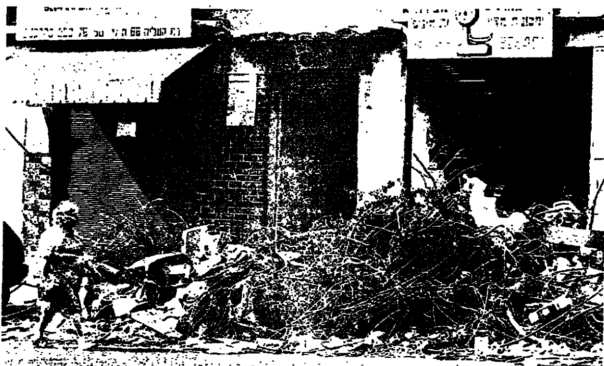
According to local residents, this huge pile of garbage on Tel Aviv's Rehov Ha'aliya has not been removed for two weeks.

Education Minister Zevulun Hammer is to be discharged from Sheba Hospital at Tel Hashomer today and will probably recuperate at the Kfar Hamaccabiah sports village, a Ministry of Education spokesman stated yesterday. Hammer, 48, suffered a heart attack two weeks ago.